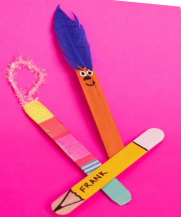
Ice Block Stick Bookmark

Many items can be used as a bookmark and these nifty ones are made of ice block sticks.