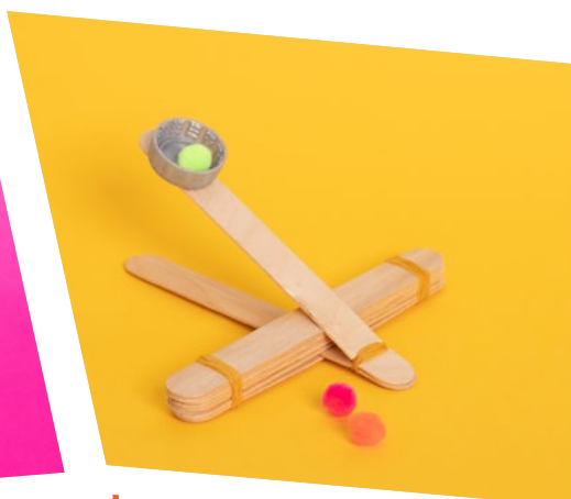
Ice Block Stick Catapult

Instructions found at oscn.nz/files/iceblockstickbookmark.pdf