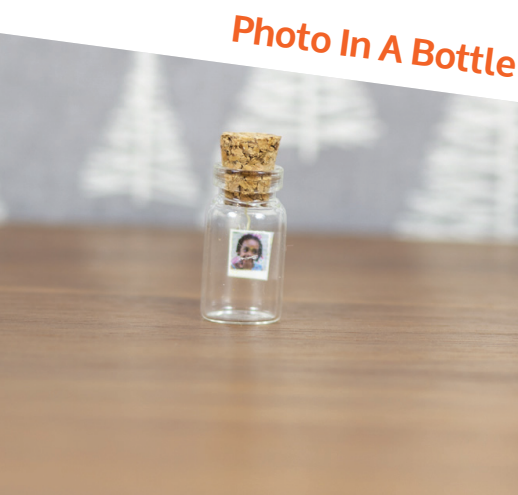
Photo In A Bottle

Instructions found at oscn.nz/files/photoblocks.pdf